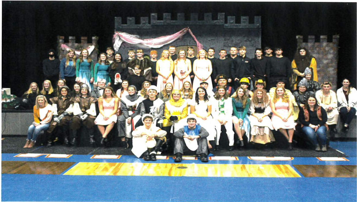
2020 H.S. One-Act Cast